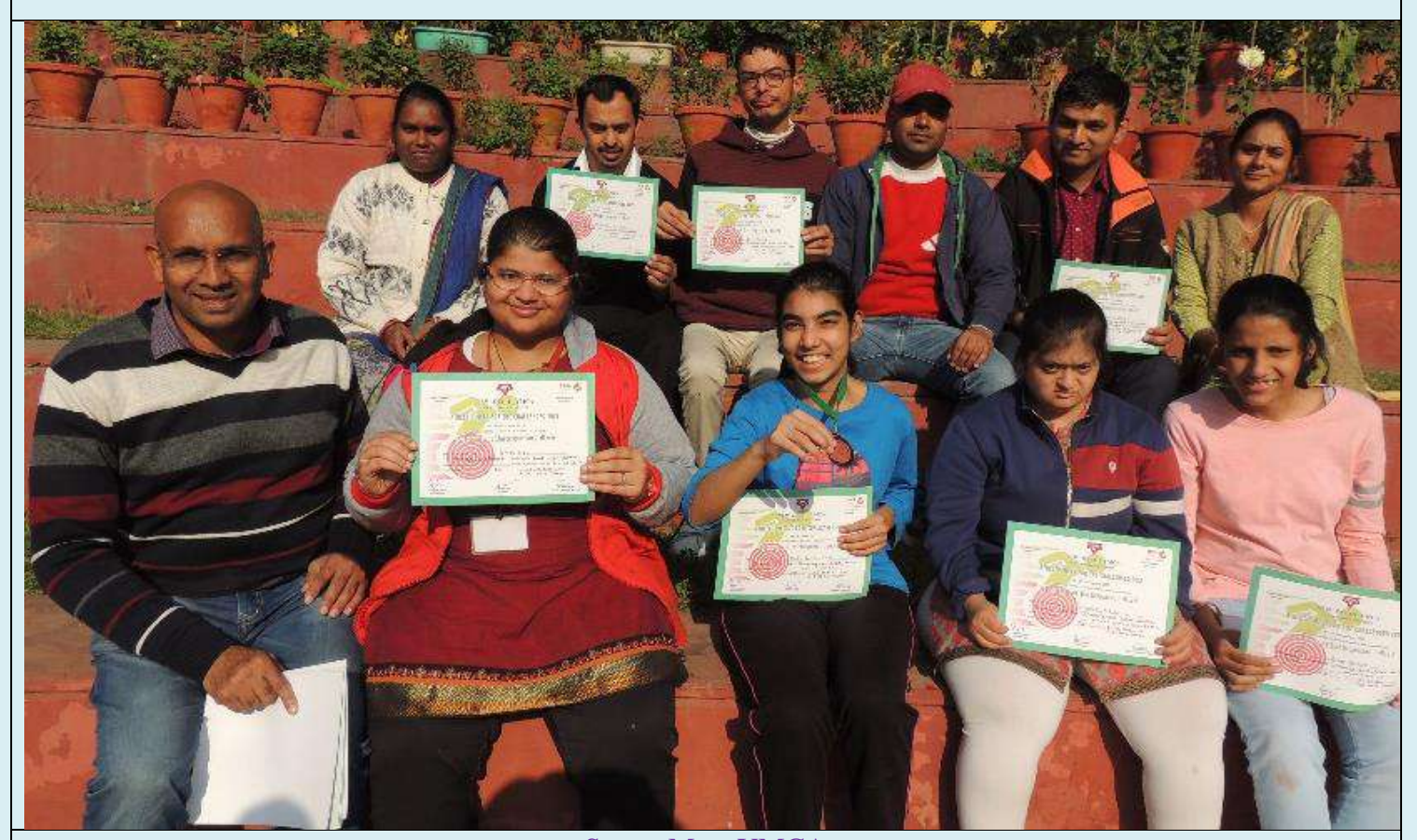
Sports Meet YMCA