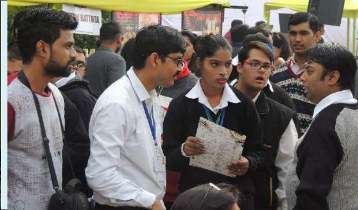
Trainees from Dept of F& B participated in "Christmas Carnival organised by British High Commission in partnership with Tamana