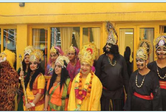
Mahisashur Vadh a Dance Drama presented by Dance Club