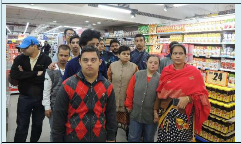
Department of Pickle Making visits Big Bazar as exposure visit, part of their Curriculum