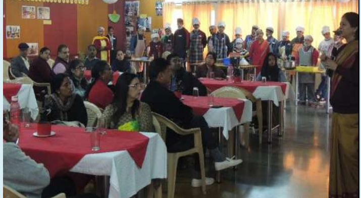
Meeting with Parents of two new project F&B and Pickle Making Dept. held to share the progress and also to show the work of their ward on 6<sup>th</sup> of December