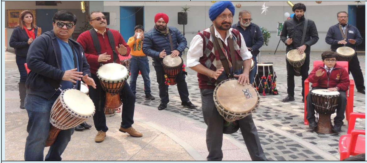
sDelhi Drumers joined Chirstmas Celebration and made it memorable & Team Muskaan enjoying.....