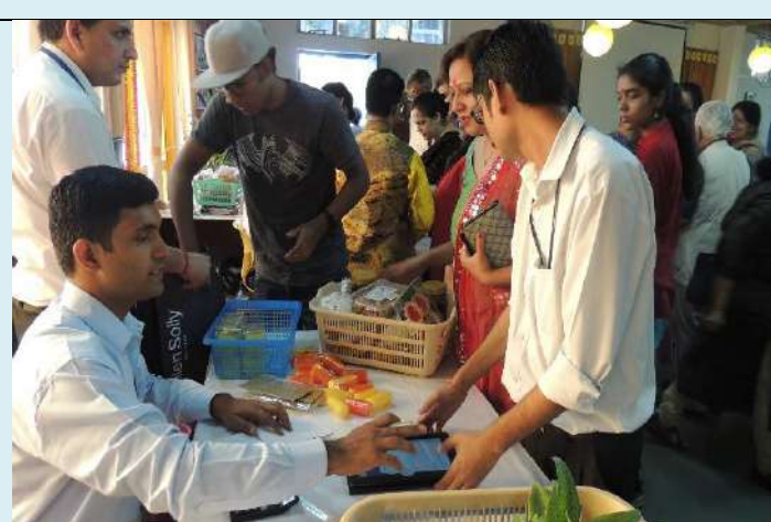
A glance of Diwali Bazaar