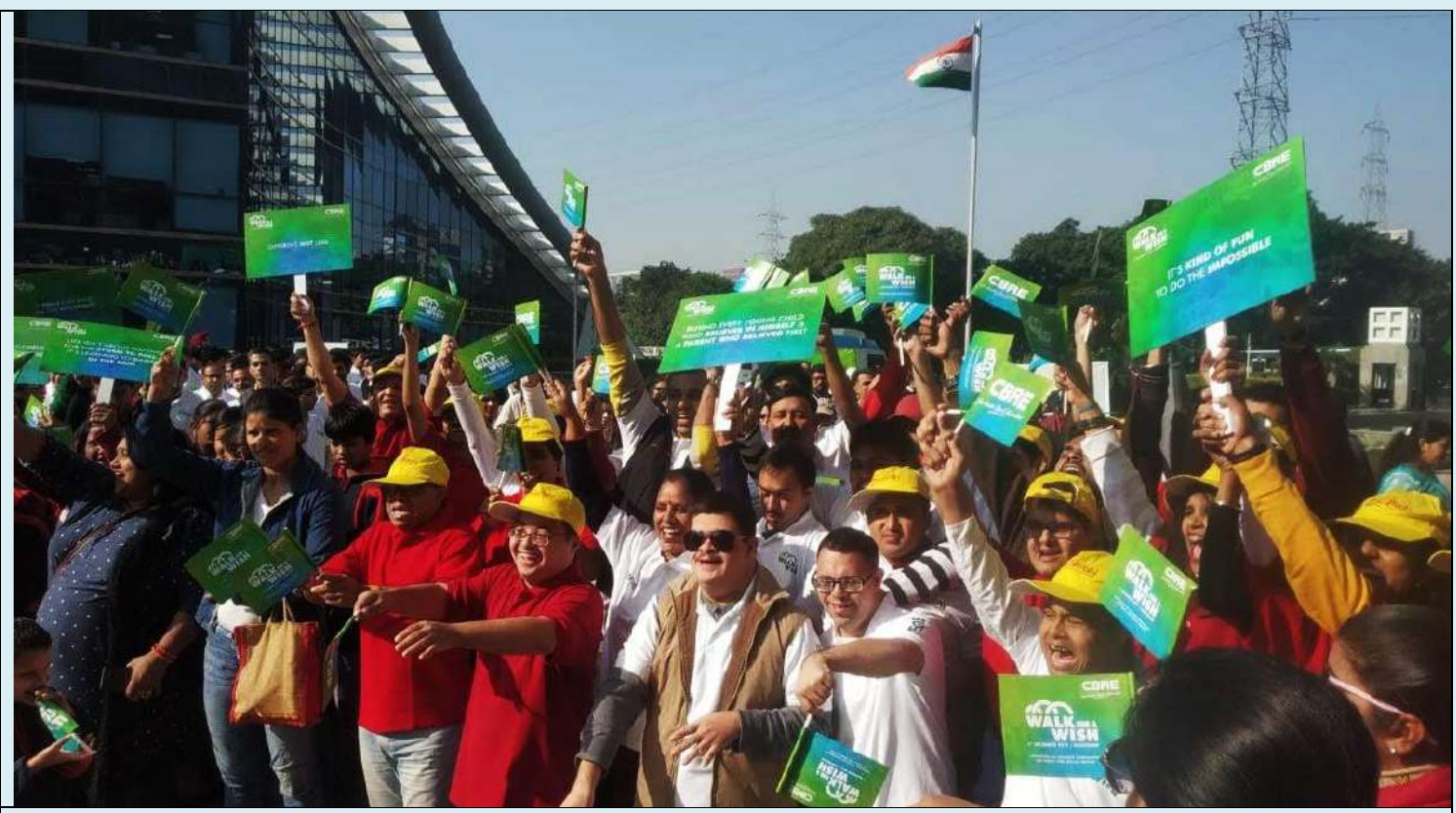
Trainees participated in Walk for Wish organised by CBRE to mark World Disability Day