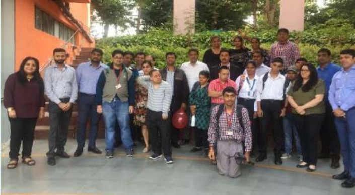
Team United Biscuits celebrate "Make Happy Be Happy Day" with trainees of Art & Activity Centre of Muskaan. They enjoyed painting with stencils & also had fun games