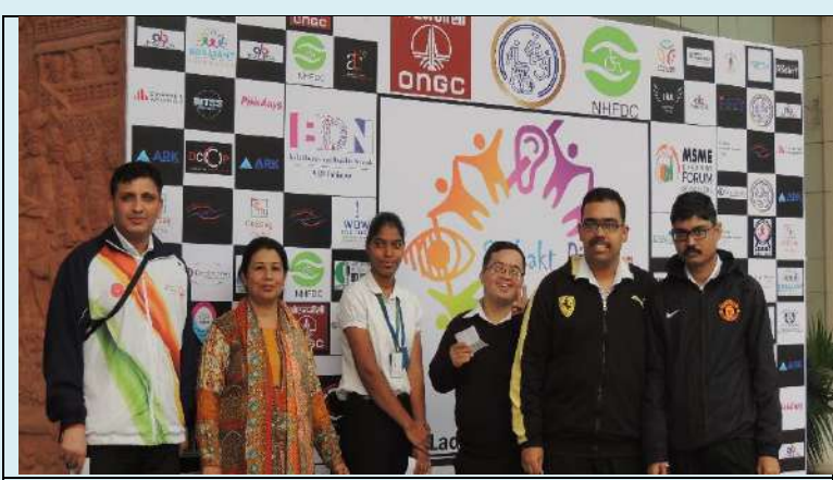
Trainees from Dept of F& B participated in "Sashakt Divyang Job Fair organised by Department of Empowerment of PwD, Govt of India