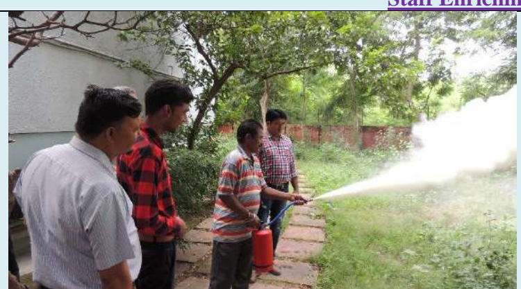
Fire drill for all staff was done on 1<sup>st</sup> October under Disaster Management training