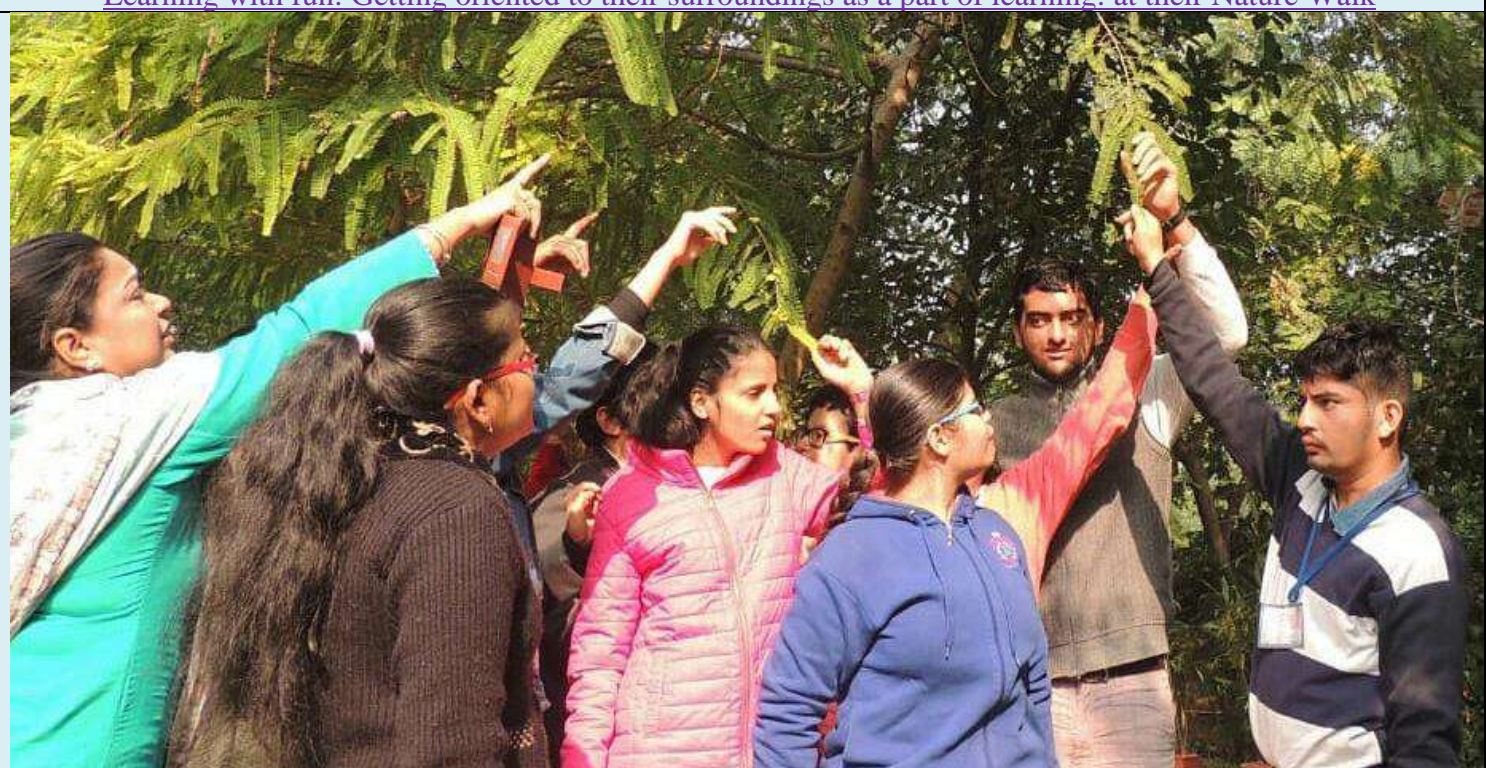
Trainees of Training & Orientation Unit & Adult Training Center Sahibabad jointly went to Gandhi Smriti on the occation of Gandhi Jayanti

Learning with fun: Getting oriented to their surroundings as a part of learning: at their Nature Walk