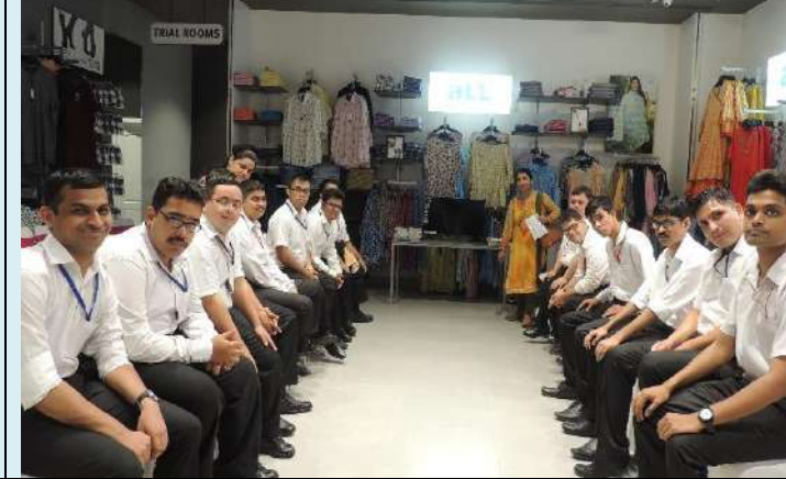
F&B Dept (Pilot Project of SCPwD) attended and explored big bazar silent hour on 16<sup>th</sup> November