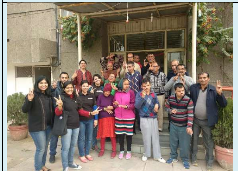
Team Deolite come to celebrate their annual day with residents at Dera