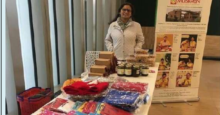
Winter Sale at Max tower house on 30<sup>th</sup> Dec