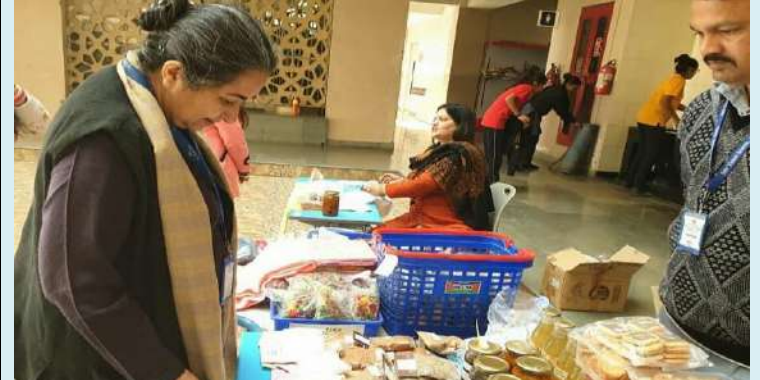
Sale at Shiv Nadar School during Ability week

During Diwali apart from Diwali Bazaar at Muskaan we have showcased our products at 24 venues for sale, got 10 bulk orders from cooperates, Volunteers from Bank of America, Lady Shri Ram College & Ashtavakra worked along with our trainees during Diwali Period