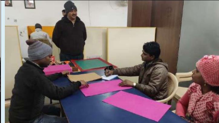
Three Employee from Kiran Society, Varanasi attended a training program at our stationary unit on 19<sup>th</sup> December