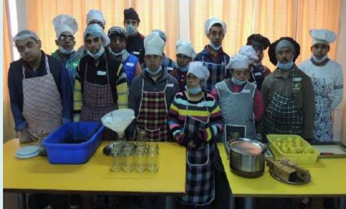
Trainees of Department of F&B and Pickle Making presenting their skills to parents & staff