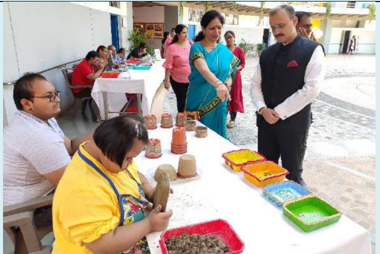
An exhibition on how our trainees work in their respective units presented live for the guests at Diwali utsav