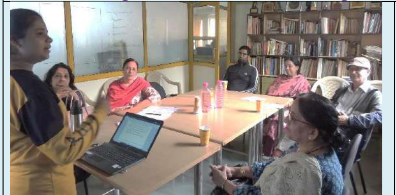
Mid term PTM of Art & Activity Center held to share progress of the trainees

Counselling: 20 families attended counselling sessions in this quarter in which 15 were for admission