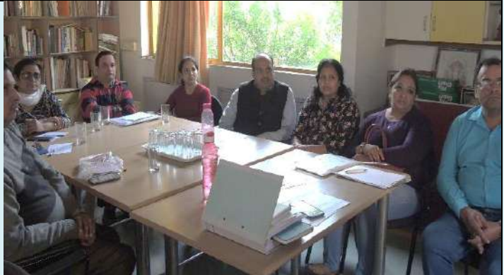
Parents Meeting for new admisson on 20th November