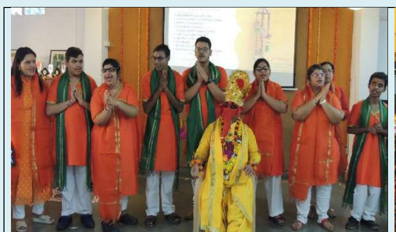
Ganesh Vandana presented by Music Club