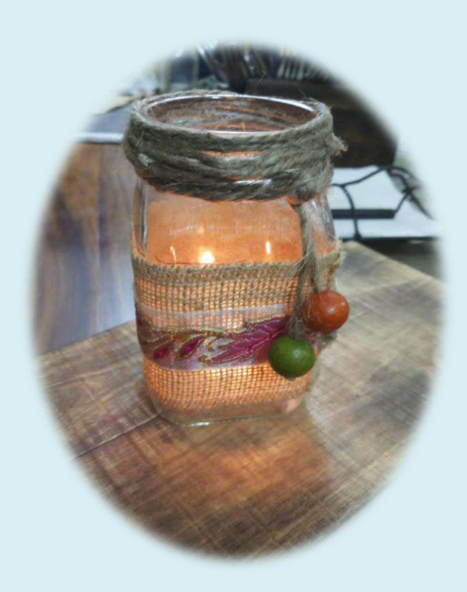
A beautiful Candle Stand for this Diwali designed by Art & Activity Unit